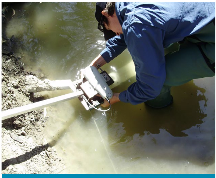
Right out of the box, with just a quick survey of the riverbed and water flow meter delivered extremely accurate level and flow data.